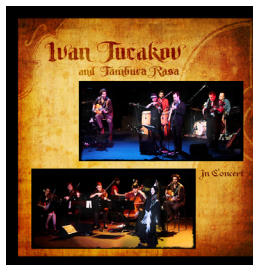
CD “In Concert” (2012)

Nominated for the Western Canadian Music Award 2011 World Recording of the Year.