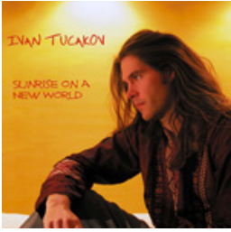
CD “Sunrise on a New World” (2004)

Features West African music styles, Middle Eastern, Afro-Cuban and Indian Classical fusion. The song Cinnabar was featured on the Cafe del Mar Compilation CD Vol. 13.