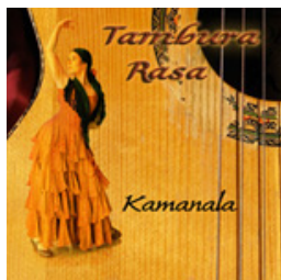
CD “Kamanala” (2008)

Flamenco compases Bulerias and Alegrias, Indian Ghazal, plus Balkan, Tango and Chinese blends.