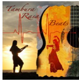
CD “Tambura Rasa Beats” (2009)

Flamenco Tango and Middle Eastern Fusion, Balkan Rhythms with Bulgarian musical art-forms; Afro-Latin mixed with Reggae; Indian Classical, R&B fusion.