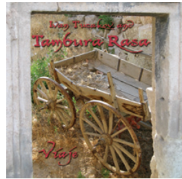
CD “Viaje” (2006)

Features West African music styles, Middle Eastern, Afro-Cuban and Indian Classical fusion. The song Cinnabar was featured on the Cafe del Mar Compilation CD Vol. 13.